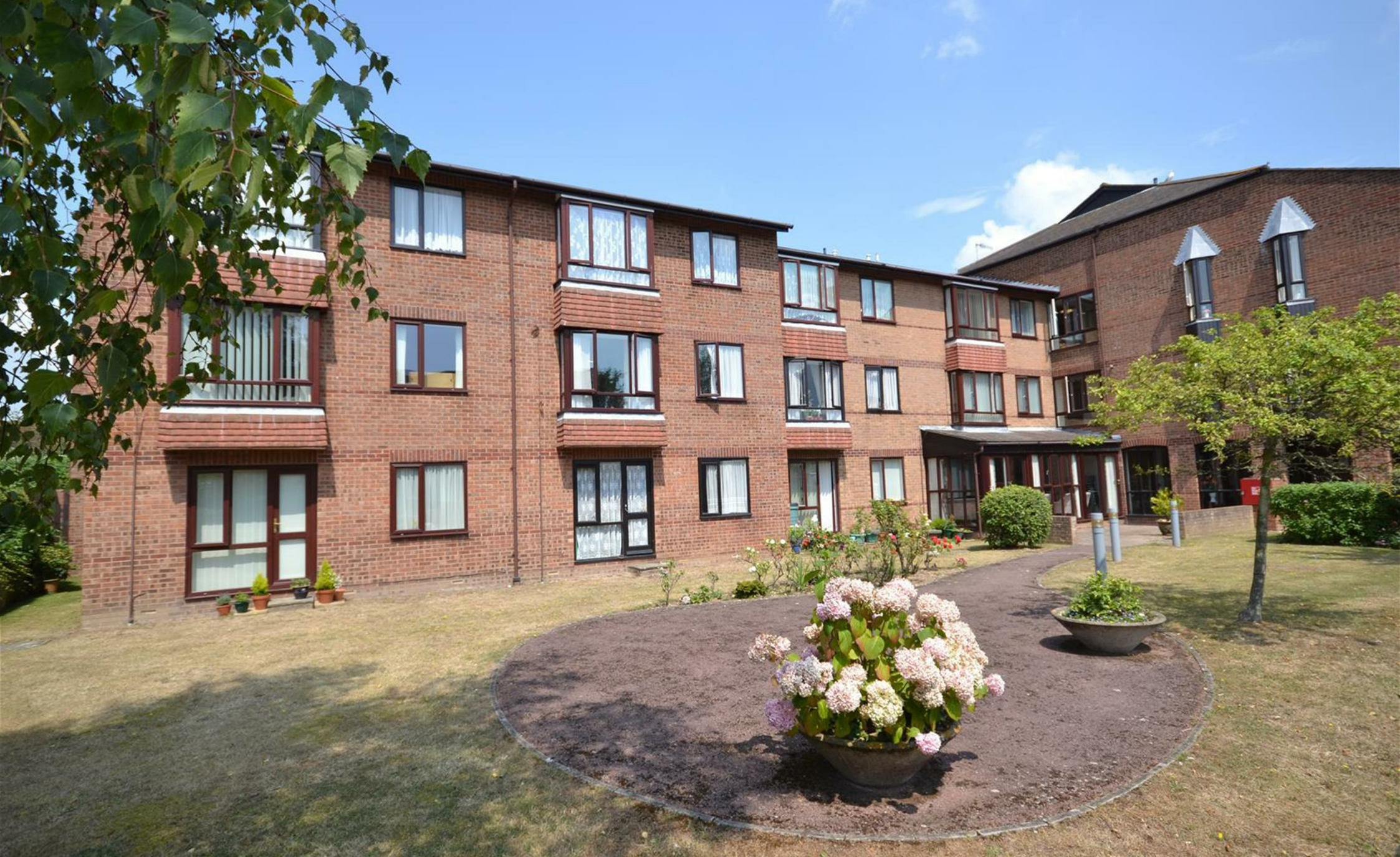
Penrith Court Broadwater Street East, Worthing, BN14 9AN Guide Price £95,000